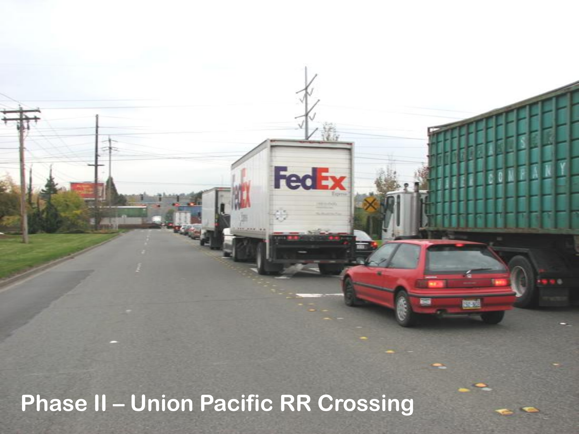
Phase II – Union Pacific RR Crossing